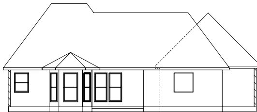
REAR ELEVATION SCALE 1/8" = 1'-0"